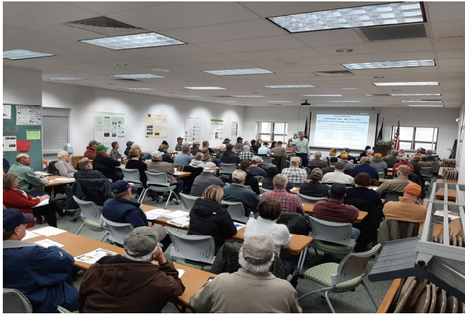
Farm Business Educators explain the Farm bill.