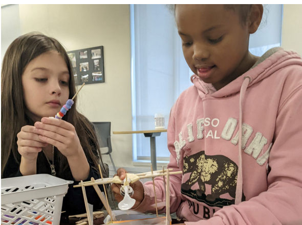
4-H offers youth the opportunity to pick an animal or still-life project and learn throughout the year. The culmination is often the show at the County Fair.