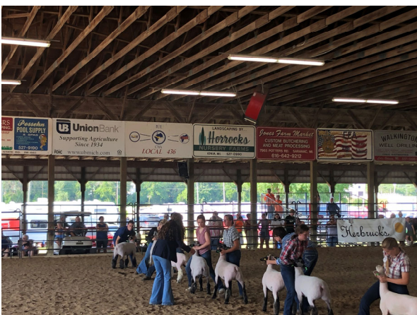
4-H is Michigan's largest youth development