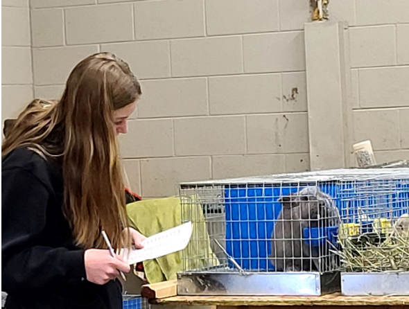
The MSU Extension Children and Youth Institute provides programs for youth, caregivers, and families.